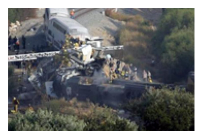
Texting While Driving